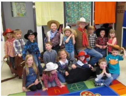
Preschool class dresses up for "Western Day"

guitar so he could teach them some campfire songs!