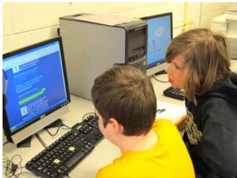
Above: Students learn vocabulary for the weather in the computer lab.

The fifth grade Spanish class has been using technology this year to enrich their language and cultural learning. Our current unit is weather. After reviewing weather vocabulary in class, we went to the computer lab where students learned new weather-related terms and current local weather condi-