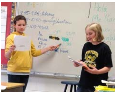
Below: Fifth grade students report el tiempo.

tions by visiting Spanish weather websites. They then used this information to present weather reports to their classmates.